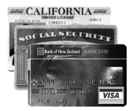
The objective of many Web application attacks is to steal sensitive customer data.